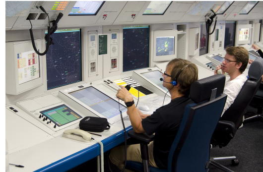
Figure 1. An air traffic controller dyad at the German air traffic control center in Munich.

and the abilities of the individual to cope with the situation [5]. Since time pressure is a situational characteristic in the daily work of air traffic controllers, the occurrence of negative stress and its emotional and psychological consequences (short term: anxiety, despondence, anger, cognitive impairments; long term: fatigue, health issues, depression) is likely (see for instance [6][7]). Therefore, the reduction or rather avoidance of stress inducing situations is an important goal in the daily work of air traffic controllers.